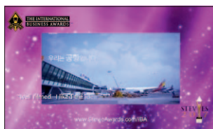
Korea Airports Corporation