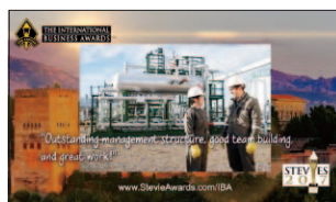
Pan American Energy