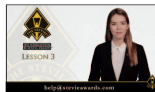
Lesson 3: Tips on How to Prepare Great Entries