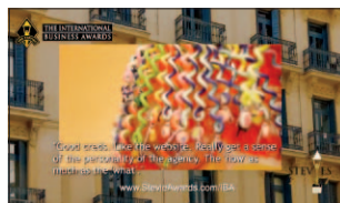
Eff Creative Group