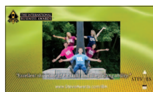
University of Limerick