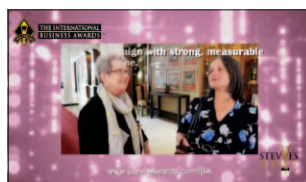
SABC Pension Fund