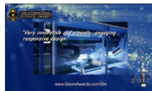
Homag Group AG