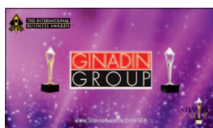
The Gina Din Group