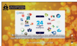
Dubai Smart Government