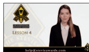
Lesson 4: How Past Stevie Winners Have Benefited by Winning