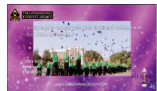
PT Petrokimia Gresik