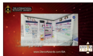
PSP Pharma Ltd