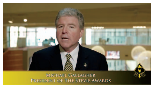
Stevie Awards president talks about the 2018 International Business Awards.