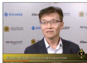
Korea Expressway Corporation