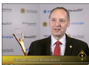
Stephen Gill Associates