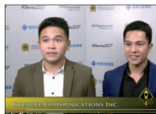
Geenger Communications Inc.