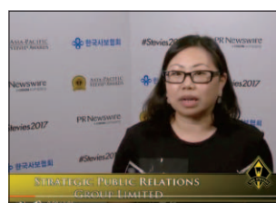
Strategic Public Relations Group