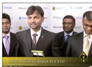
CISCO System India