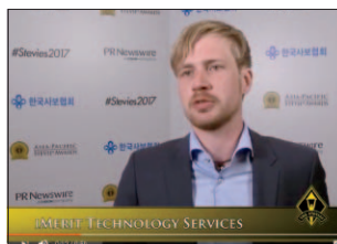
iMerit Technology Services