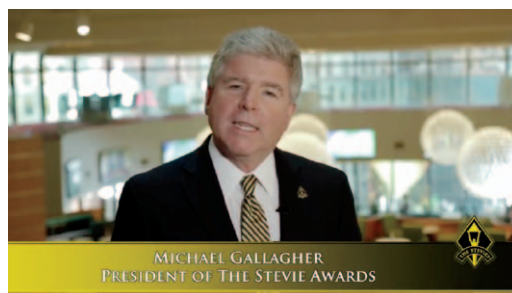
Stevie Awards president talks about the 2018 Asia-Pacific Stevie Awards.