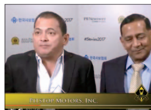
Pitstop Motors, Inc.