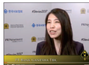
PT Bank Ganesha