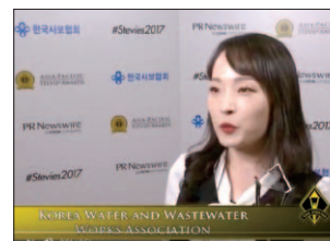
Korea Water and Wastewater Works Association