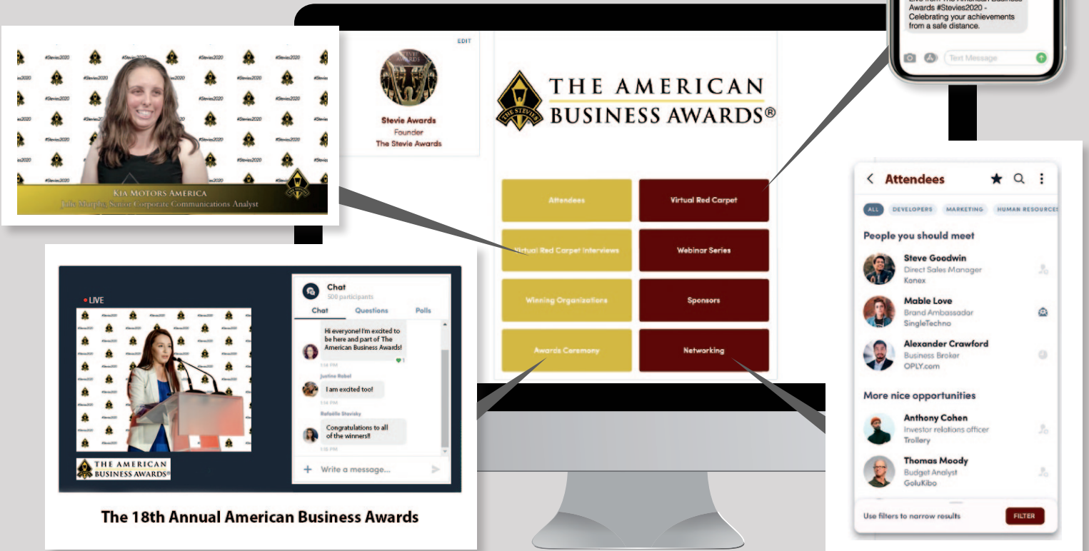
The 18th Annual American Business Awards