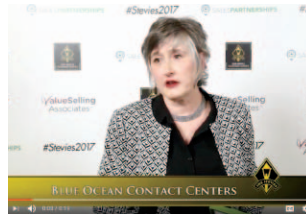
Blue Ocean Contact Centers