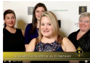
ClearVision Optical Company