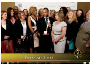
Delta Air Lines