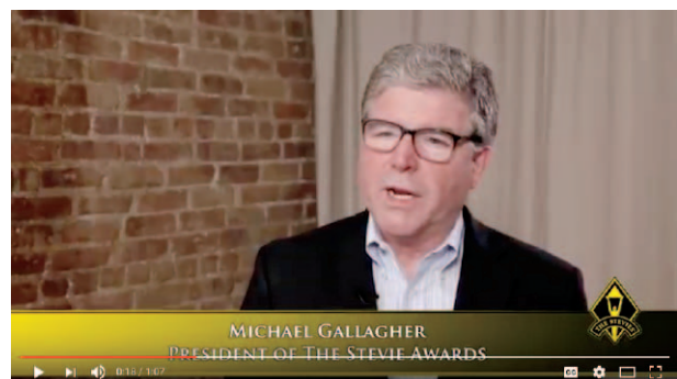
Hear from the Stevie Awards president about the awards