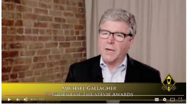
Hear from the Stevie Awards president about the awards