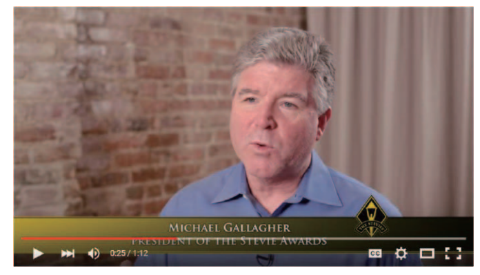
Hear from the Stevie Awards president about the awards